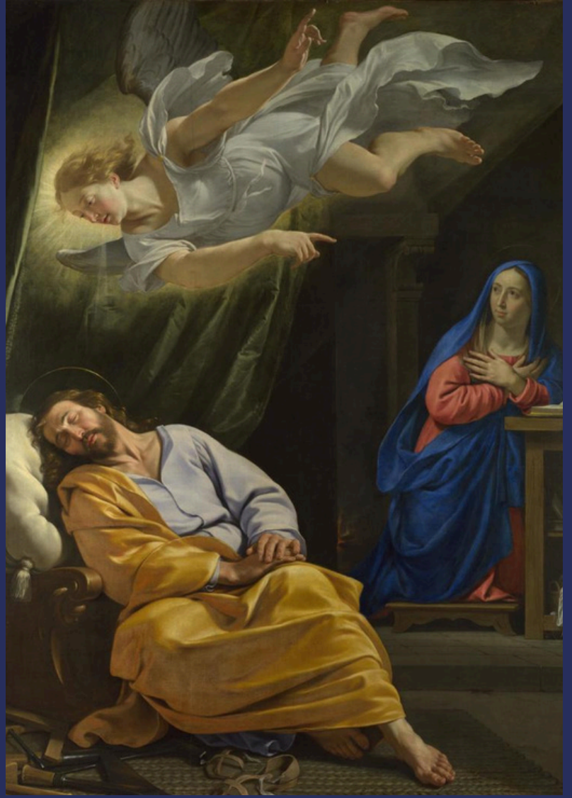
Philippe de Champaigne “The Dream of St Joseph” (1642-43)

“Joseph, son of David, do not be afraid to take Mary as your wife, for the child conceived in her is from the Holy Spirit. She will bear a son, and you are to name Him Jesus, for He will save His people from their sins.” Matthew 1:20-21 (NRSVA)