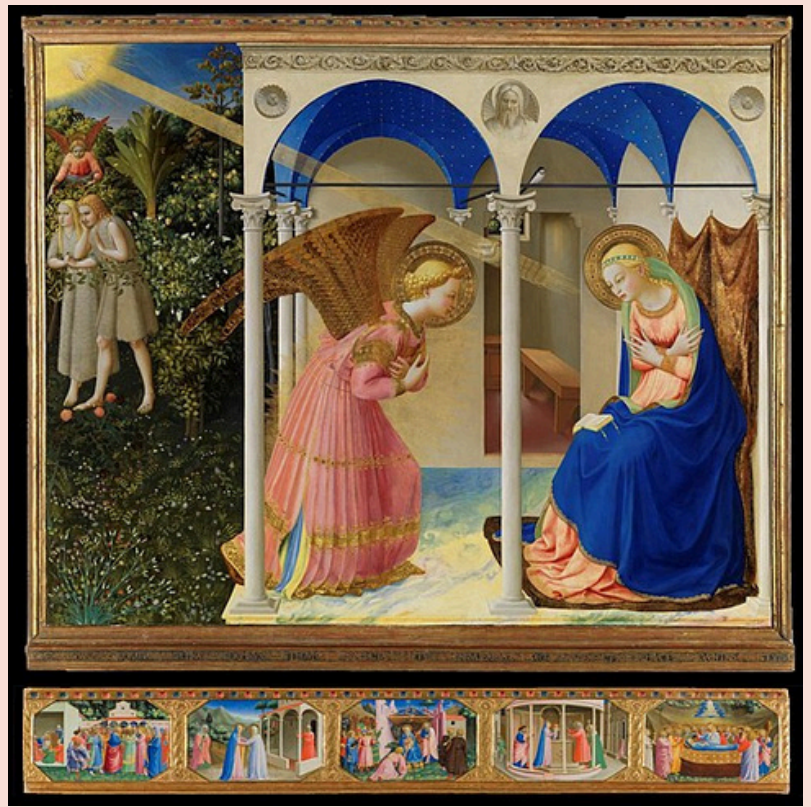
Fra Angelico “Annunciation” (1426, Madrid)

“But when the fullness of the time was come, God sent forth His Son, born of a woman.” Galatians 4:4 (ESV)