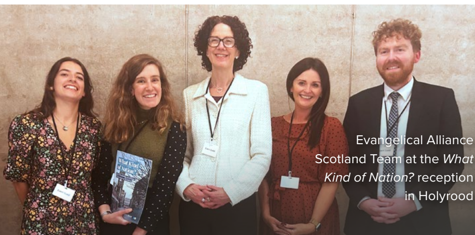
Evangelical Alliance Scotland Team at the What Kind of Nation? reception in Holyrood

Don’t forget: God wants to see all people saved, including our MSPs. Let’s reach out to them in love with the news of the greatest love.